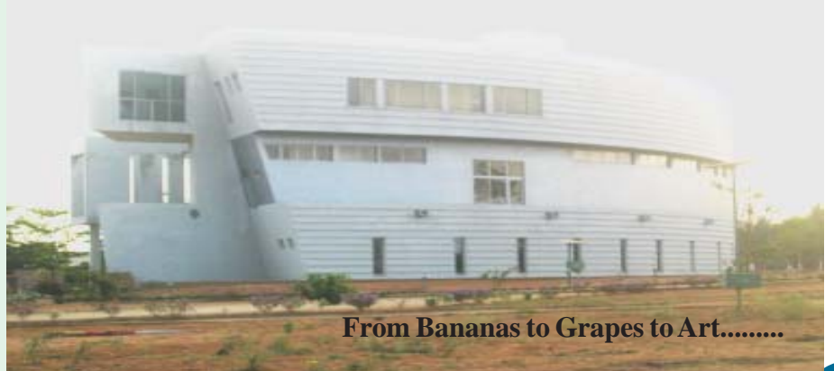
From Bananas to Grapes to Art.....