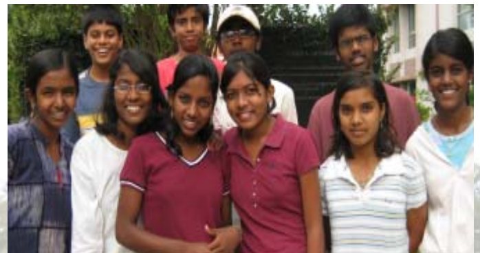
The talented class- the 9th graders