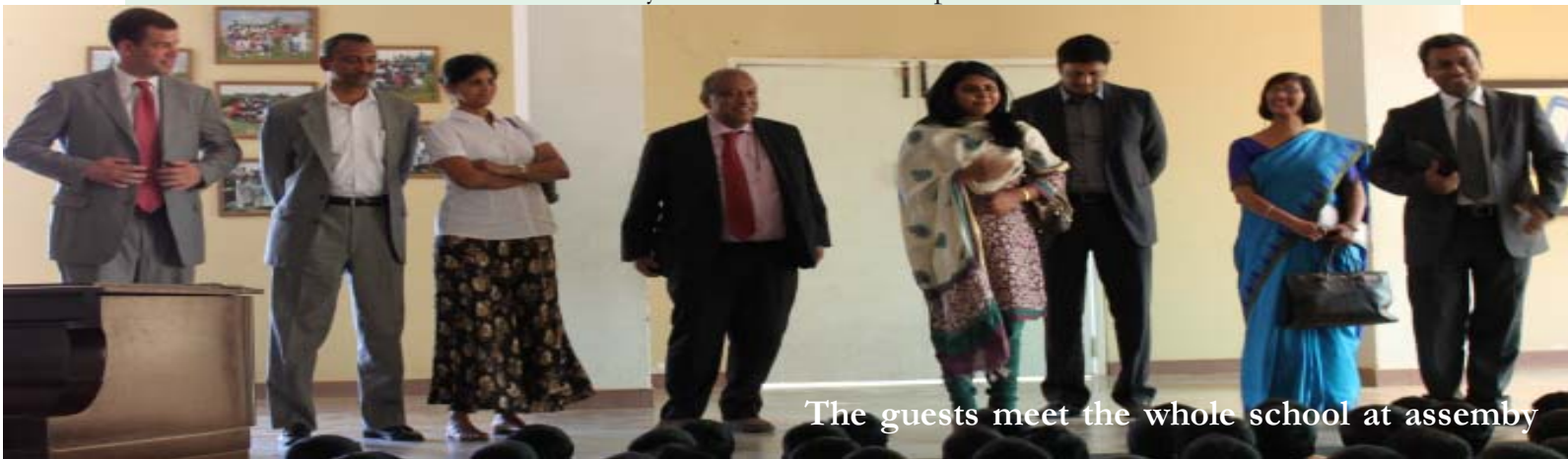
The guests meet the whole school at assembly

commented, “The news being given by the children is far better than in the Indian newspapers,” as he had not been able to read the paper that morning in his hurry to arrive at the school on time.